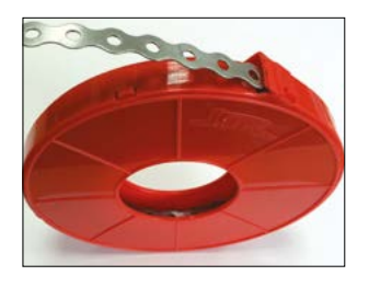
FIXINGS AND TAPES The SS50 tape is a 50mm wide, single sided butyl tape for sealing the laps, penetrations and other details.

The Termination Strip is a 12mm x 10m galvanised steel bonding strip used to fix the top edge of Sika Bentoshield® MAX LM waterproofing membrane on wall sections.